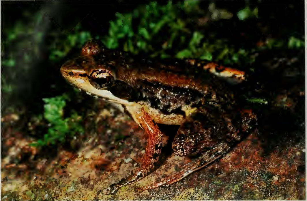
Fig. 2. Mantidactylus zolitschka , spec. nov. Female paratype (ZFMK 60116) in life.

Two further Ochthomantis species occur syntopically with M. zolitschka at An'Ala which we here assign to M. femoralis and M. mocquardi in a preliminary way. At this locality, a total of 11 M. cf. mocquardi (4 males, 5 females), 2 M. cf. femoralis (1 male, 1 female), and 12 M. zolitschka (3 females, 9 males) were compared directly in the field. Consistent differences were found in size (male M. zolitschka measuring 29-32 mm, M. cf. femoralis 38 mm, M. cf. mocquardi 39-45 mm SVL), in tympanum size (TD about \frac{1}{5} of ED in M. zolitschka , \frac{1}{10} - \frac{1}{4} in M. cf. femoralis and M. cf. mocquardi ), and in relative toe length (third toe shorter than fifth toe in all M. zolitschka , of similar length or longer in M. cf. mocquardi and M. cf. femoralis ).